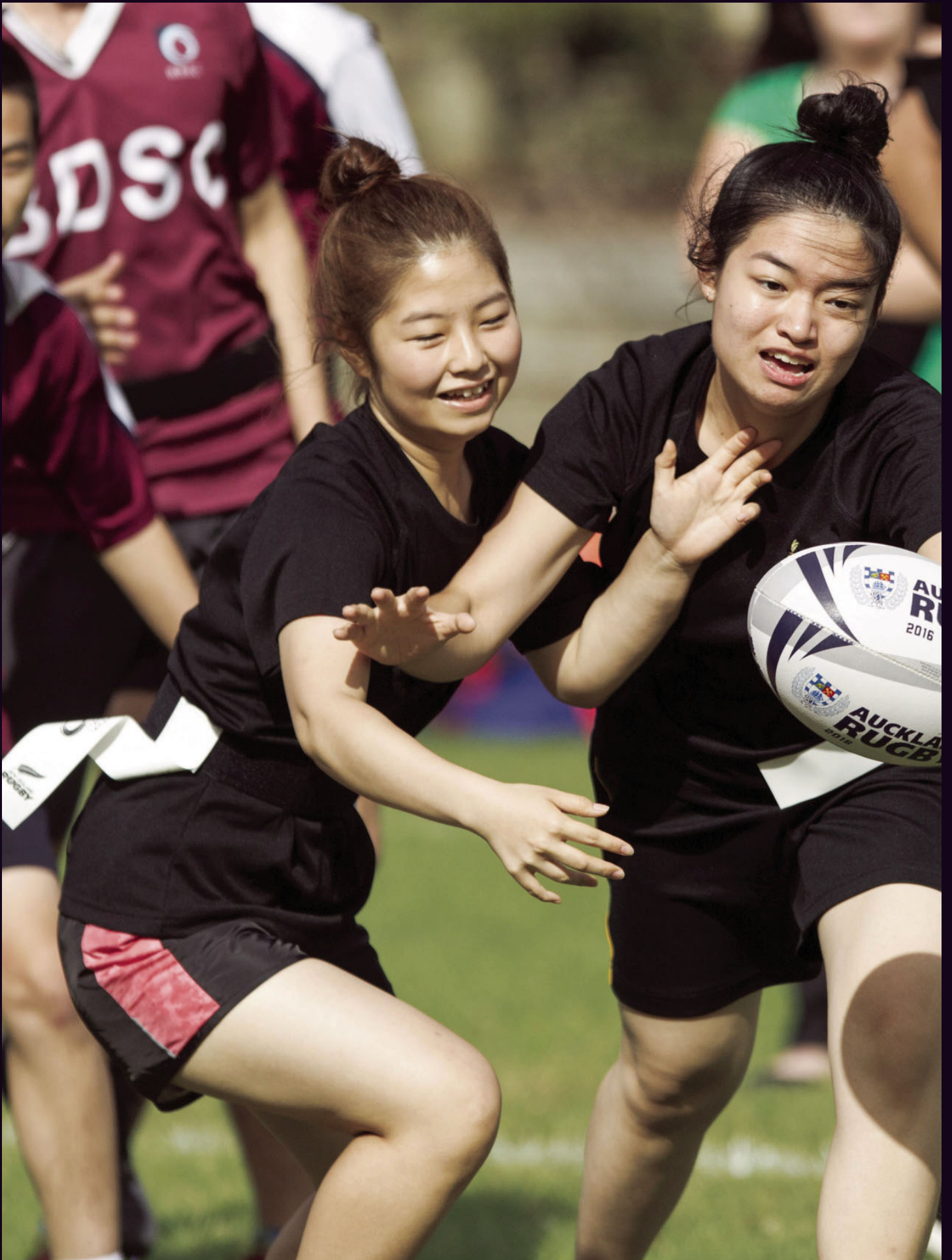
Players competing in a tournament staged for international students from across Auckland