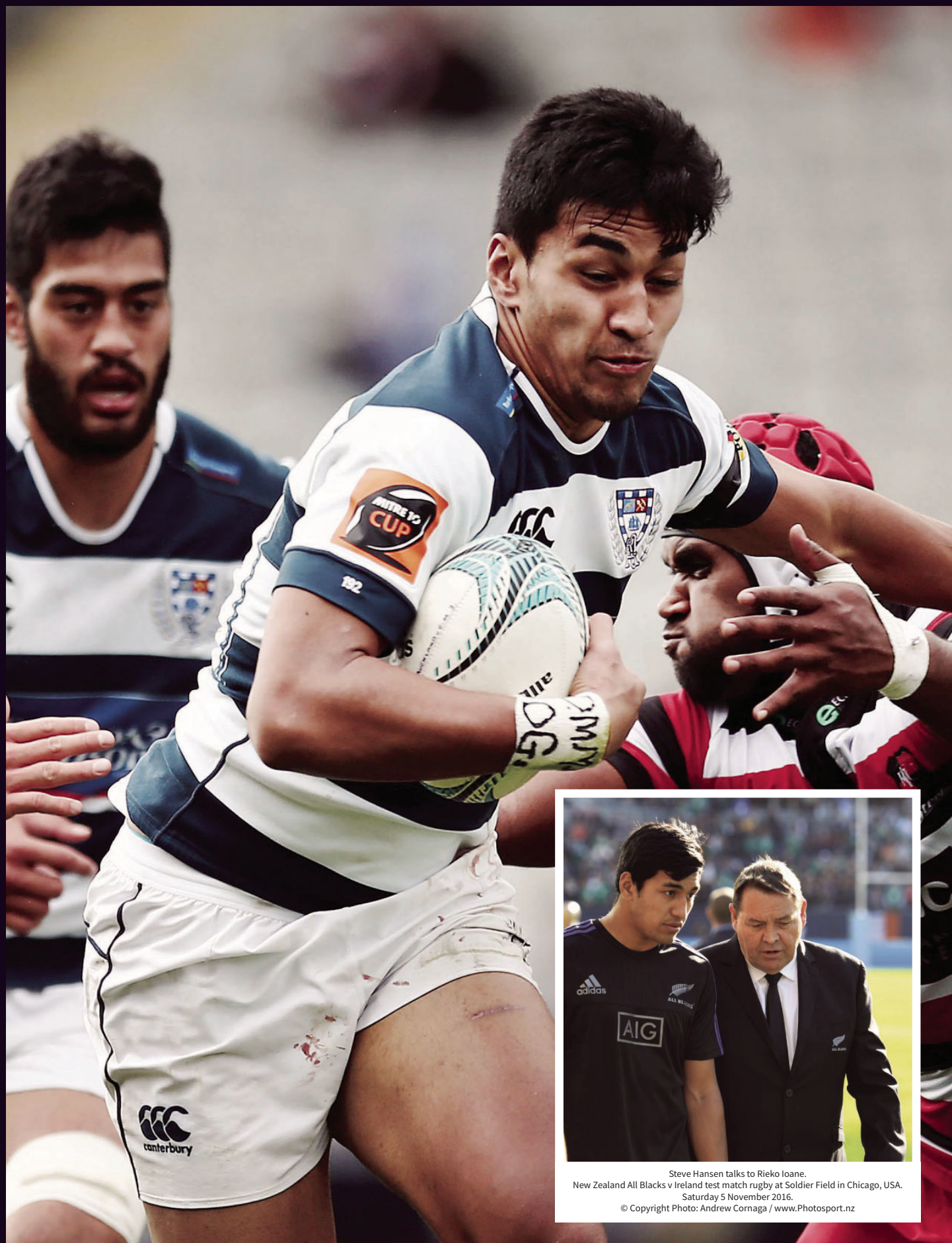
Steve Hansen talks to Rieko loane. New Zealand All Blacks v Ireland test match rugby at Soldier Field in Chicago, USA. Saturday 5 November 2016.

Mitre 10 Cup - Most metres gained (812) Most defenders beaten (62) Most tries (10) Represented All Blacks, Maori All Blacks & NZ Olympic team in one year