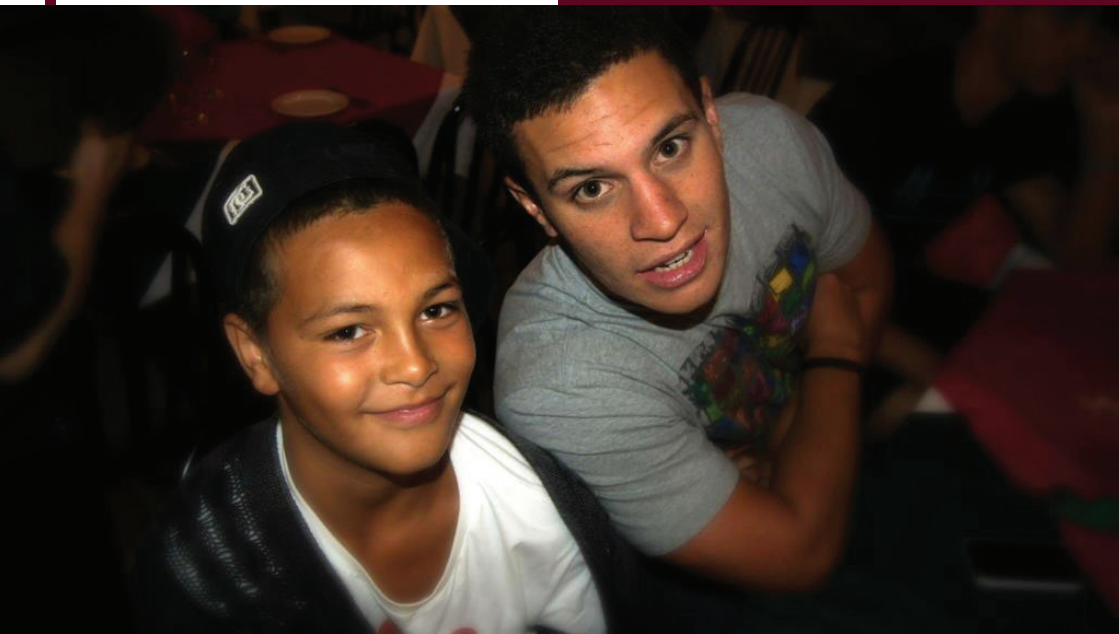
CAPTION: Jordan Petaia (left) with Matt Toomua