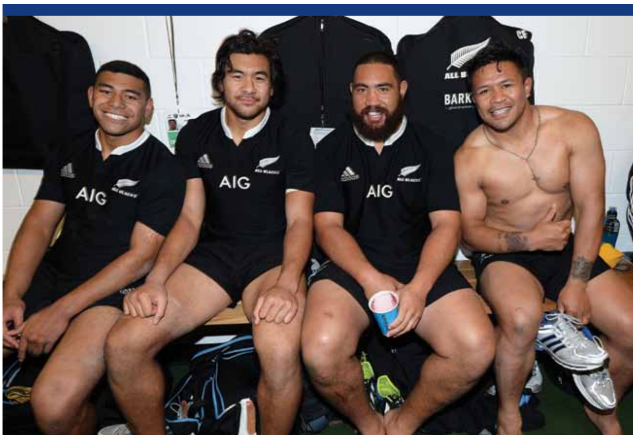
Auckland's All Blacks Charles Piutau, Steven Luatua, Charlie Faumuina and Keven Mealamu after the Wallabies Test in Dunedin.