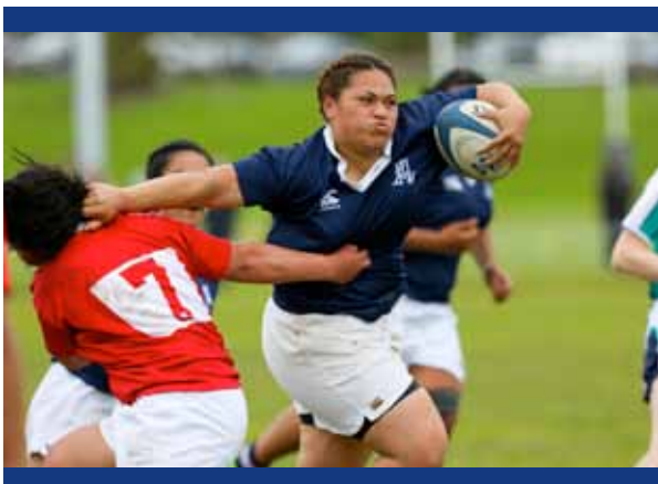
The Under 18 East and West Girls teams go head to head.