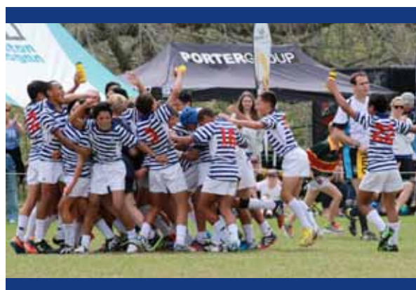
The Roller Mills East team celebrate after the final whistle.

Auckland Rugby would again like to acknowledge the considerable contribution made to the game by all those involved in Secondary School Rugby – Principals, Directors of Sport, rugby administrators, coaches and in particular, the ASSRU Executive Committee in assisting with the promotion, growth and development of rugby in schools.