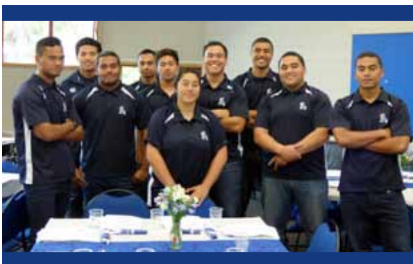
Pro Sport trainees ahead of their Healthy Eating dinner event.

Nestlé continue to be extremely generous supporters of the Pro Sport programme in a number of ways and this year has been no different. In fact, they have yet again increased their involvement and support of the programme and the students. They are leaders in the field of youth nutrition and willingly give their time, knowledge, personnel and facilities to encourage the trainees to improve their