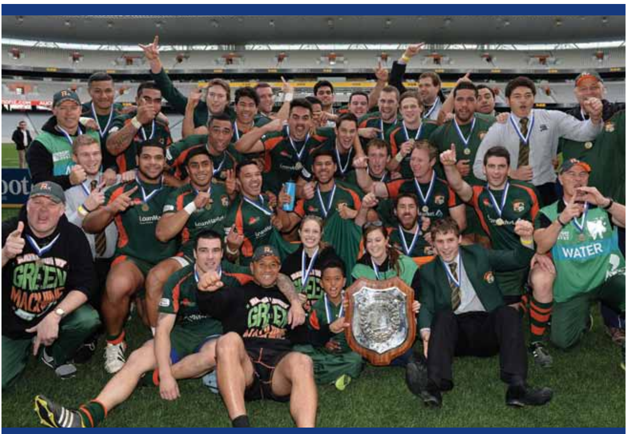
Pakuranga won the Gallaher Shield for the first time in the club's history.

Secondary school rugby maintained much interest with St. Kentigern College 1st XV again winning