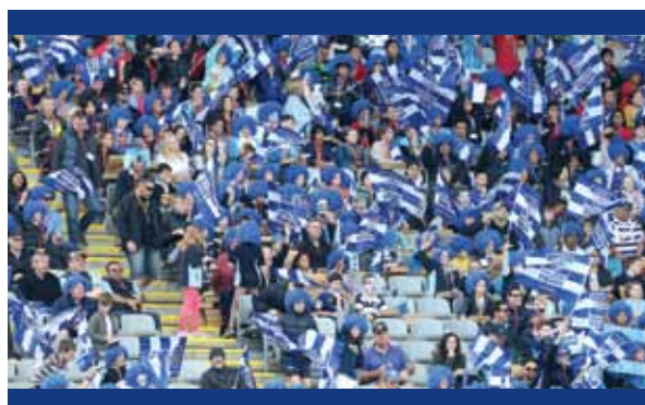
Fans enjoy the Auckland v Bay of Plenty game in the sunshine at Eden Park.

2013 saw the formalisation of ARU Men's and Women's Sevens programmes as Sevens Rugby enjoys a heightened profile since its inclusion as an Olympic sport.