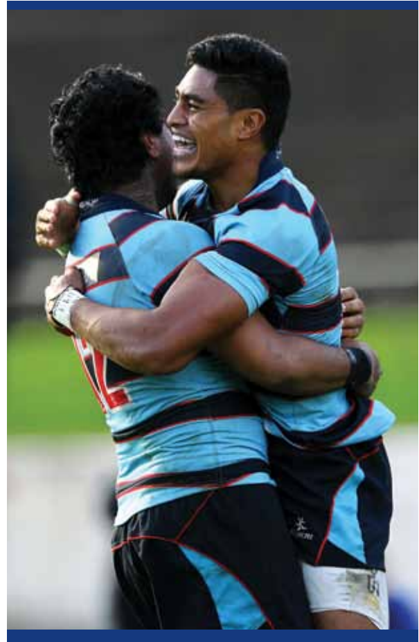
Marist players celebrate a victory over rivals Ponsonby.

Congratulations to all grade winners; Premier Reserves - Marist; U21 - Marist; U20 – College Rifles; First Grade – Teachers Eastern; Restricted