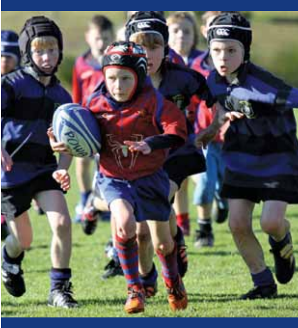
Suburbs and Ponsonby juniors enjoy a game of rugby.