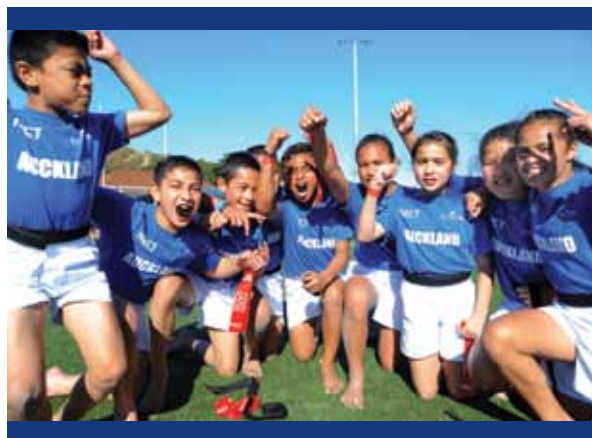
The Rippa team from Holy Cross celebrate their National Championship victory.