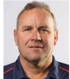
Wayne Pivac Head Coach