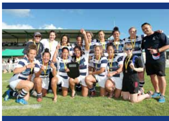
The Auckland Women's Sevens team celebrate winning the Northern Region qualifiers.

These international tournaments provide an opportunity to promote the Auckland Sevens brand and also leverage business for the International Academy.