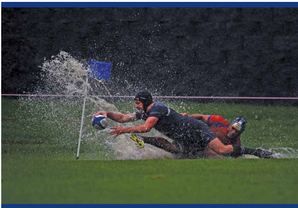
College Rifles score a remarkable try in the wet against Suburbs.

The Amateur Support Agreement between the clubs and ARU is, at the time of writing, under review. If there are any changes to the current agreement there will be full consultation with the clubs and whatever is agreed, will be reflected in the revised document. This document is anticipated to be distributed to clubs in mid December 2013. Compliance with this document is necessary to ensure and maintain a functional and uniform relationship between the clubs and the ARU.