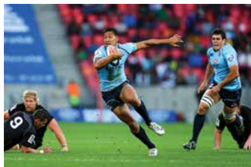
Israel Folau in action in the team's record-breaking demolition of the Southern Kings

The 72-10 demolition of the Kings in round 12 was another highlight. Breathtaking at times, the Waratahs were on their game, some of the tries were simply magnificent and the execution on the day was made for movies. The 11-try walkover delivered everything Tahs' fans had hoped – for years – to see.