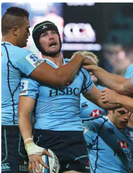
Man of the Match Berrick Barnes is congratulated by team mates after lifting the team to victory

A man-of-the-match performance from replacement Berrick Barnes lifted the HSBC Waratahs to a nail-biting 28-22 victory over the Brumbies at ANZ Stadium.