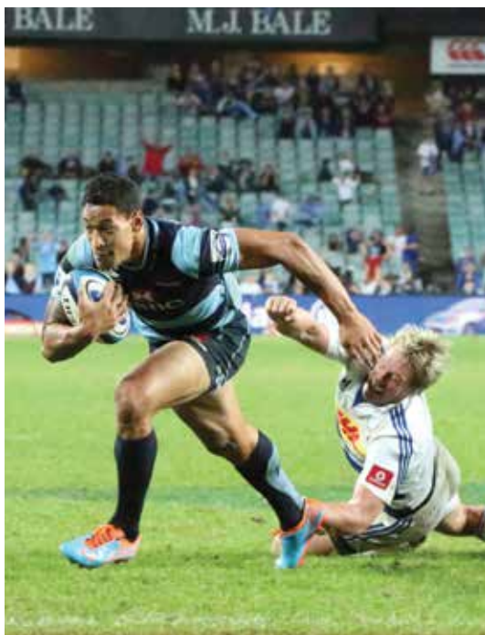
A last-minute Folau try steals victory in a bruising Stormers encounter

SATURDAY 11 MAY, ALLIANZ STADIUM, SYDNEY