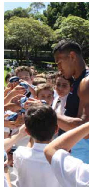
Israel Folau surrounded by students following a training session at Newington College