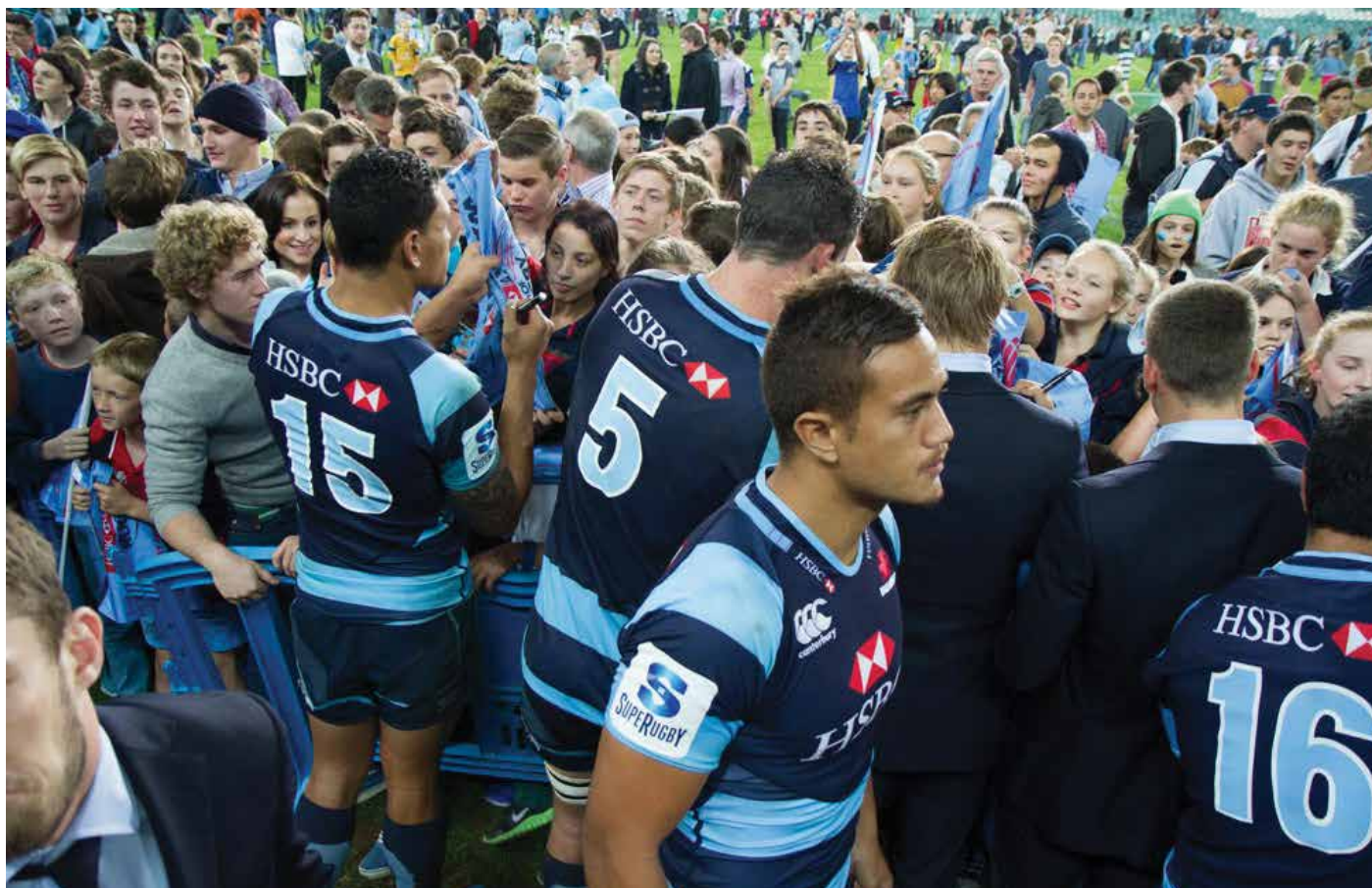
Players join fans for the ever popular Tahs on Turf after the the round 13 win over the Stormers