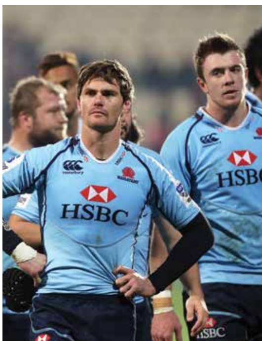
Dejected NSW players leave the field after being deprived by a second-half Crusaders fightback

FRIDAY 31 MAY, AMI STADIUM, CHRISTCHURCH