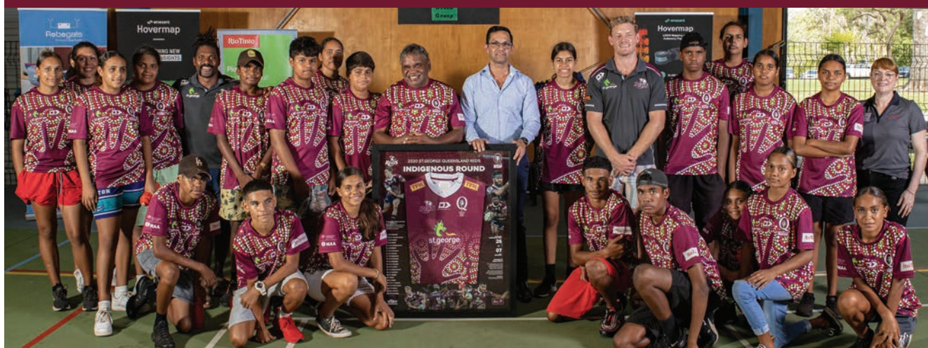
The 2020 Future Indigenous Leaders Camp was hosted at YMCA's Camp Warrawee on Brisbane's north-side

The QRU workforces delivers the program at schools around the state, with both Primary and