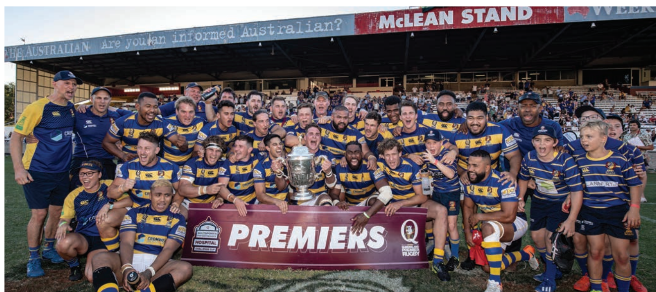
Easts capped off a significant weekend for the club with their first Hospital Cup win since 2013.