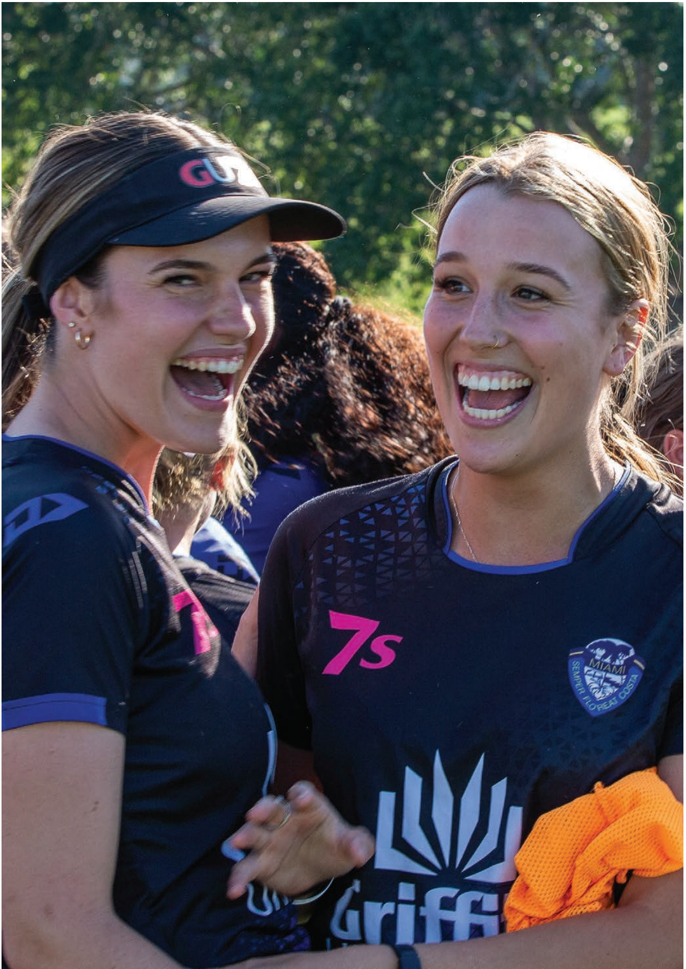
Miami SHS students at the 2020 All Schools Sevens