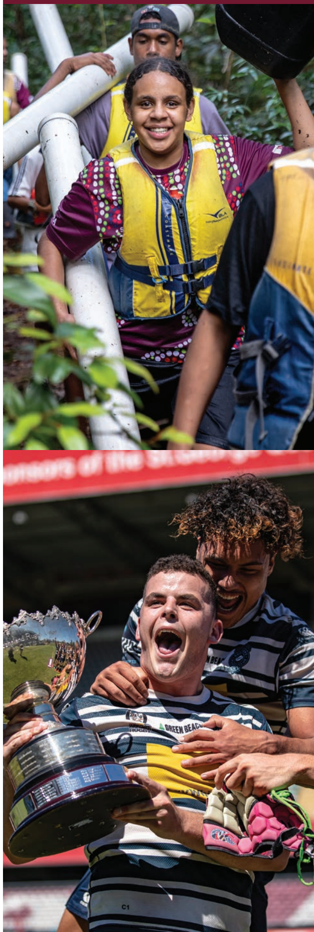
TOP - Future Indigenous Leaders Program students on camp BOTTOM - Brothers celebrate their Colts 1 win