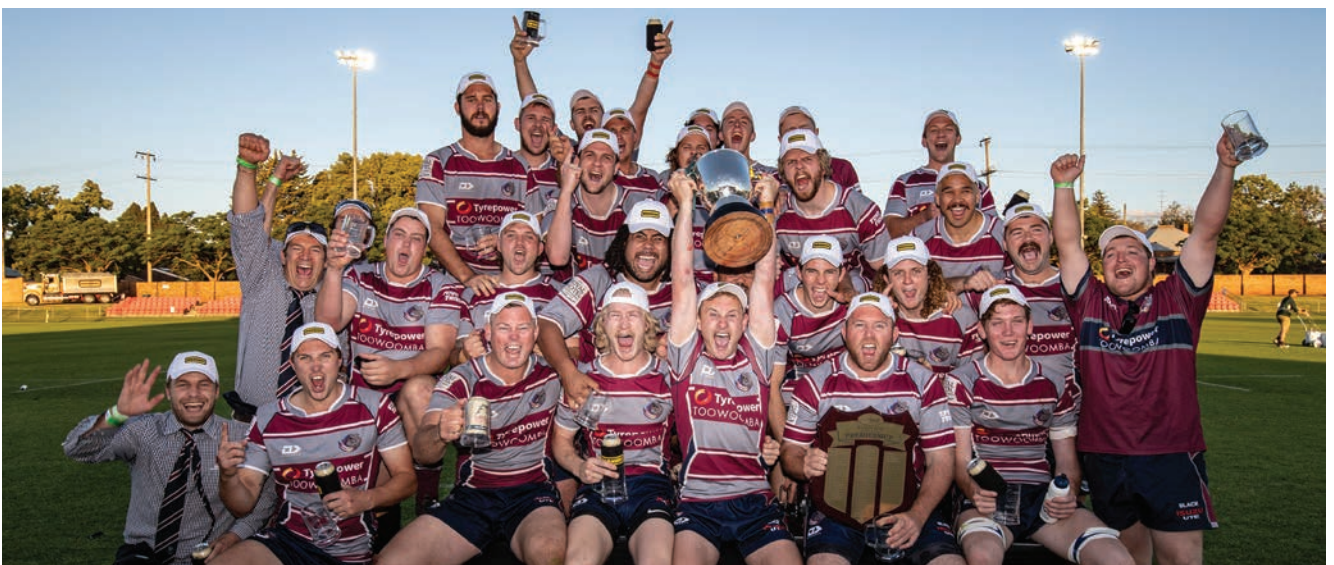
Toowoomba Bears celebrate their first Risdon Cup in 10 years