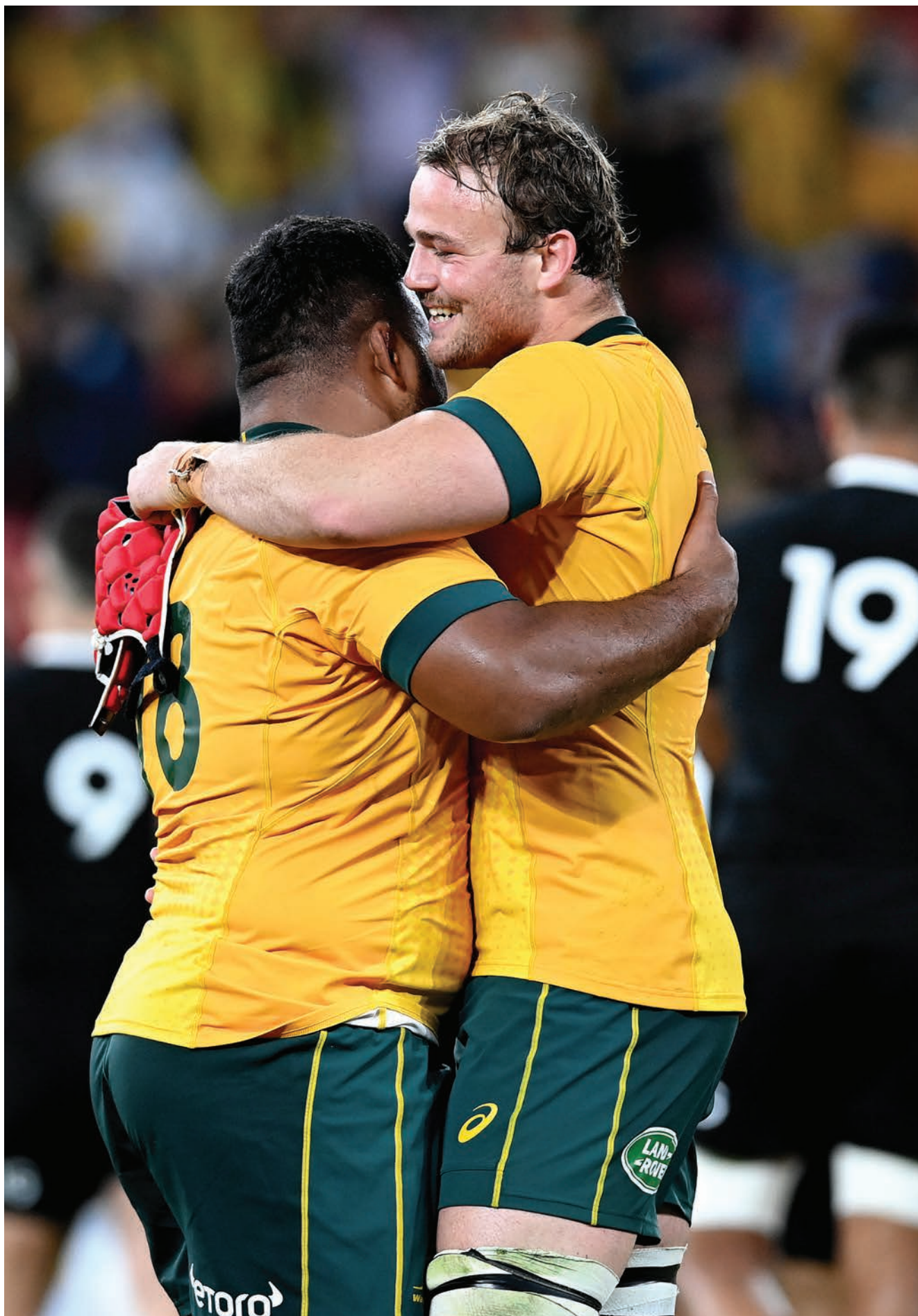
Queensland Reds Taniela Tupou and Harry Wilson embrace after a Test match win over the All Blacks