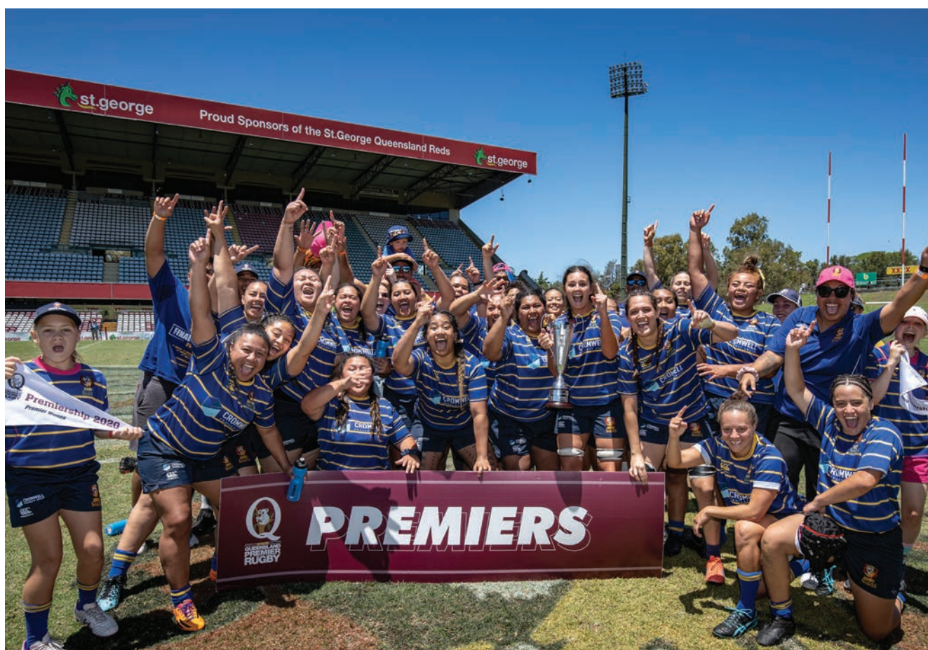
After returning to the Premier Rugby fold in 2020, Easts went through the season undefeated.

WOMEN'S PREMIER RUGBY GRAND FINAL East 17 GPS 15