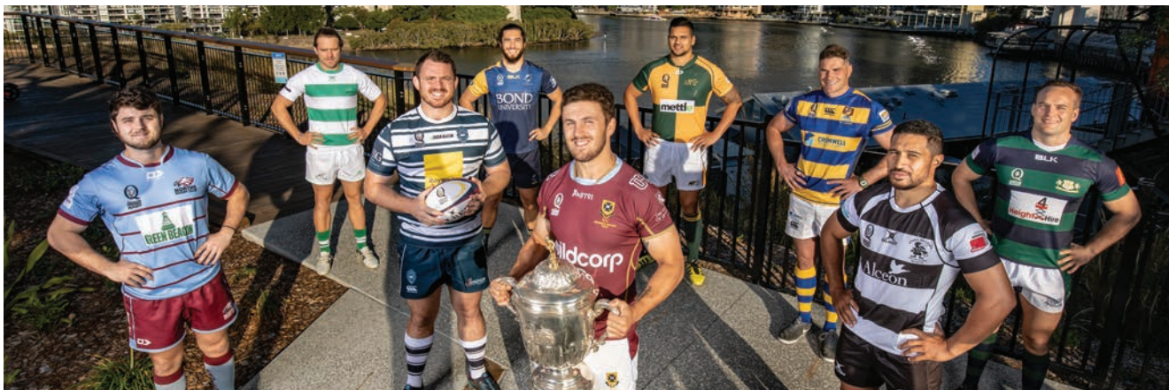
Representatives from the nine Queensland Premier Rugby clubs gather to re-launch the competition post lockdown.

won the Hospital Cup Grand Final and five other premierships across the grades including the Women's Premier Grade competition, a new record for any club within Premier Rugby.