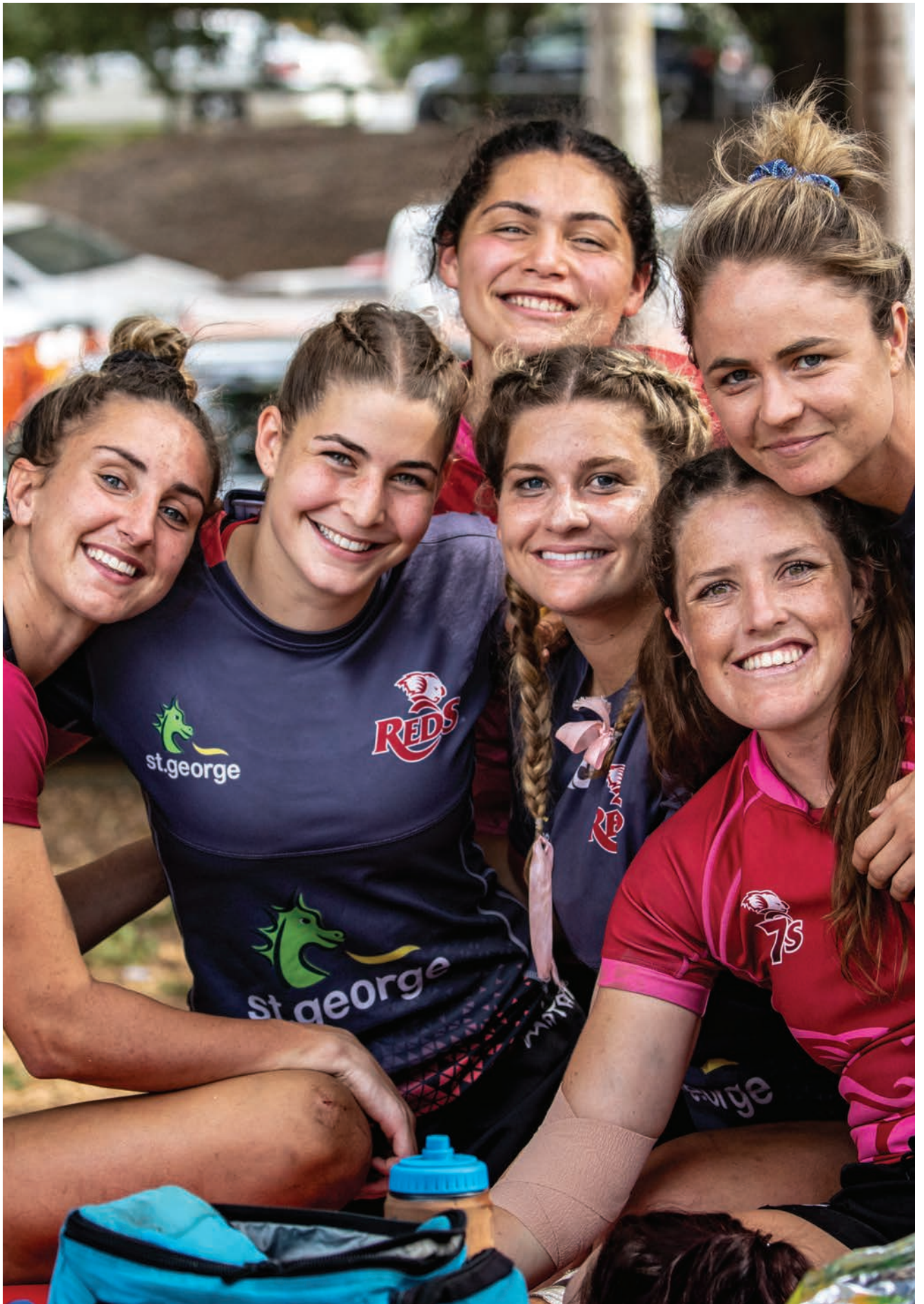
QAS Women's Sevens athletes pictured at the BrisVegas Sevens tournament at Wests Rugby Club.