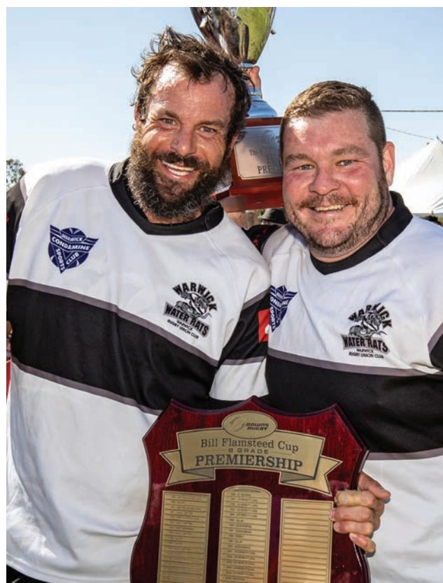
Warwick Water Rats won their maiden Darling Downs B Grade title.

In Mt Isa, Keas defeated Euros 17-14, with the Fraser Coast Mariners claiming a comprehensive victory over Brothers Turtles in Bundaberg on Grand Final day.