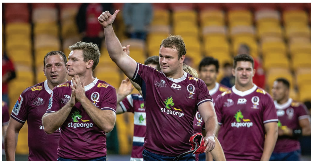
Queensland Reds thank fans after Qualifying Final at Suncorp Stadium