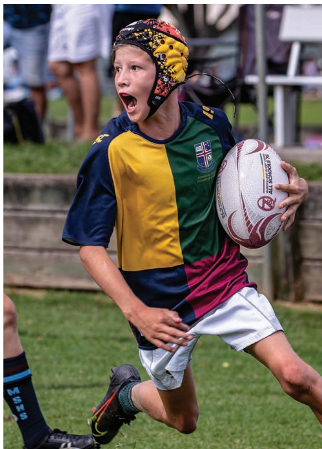
Sunshine Coast Grammar in action at All Schools 7s

RUNNERS UP - St.Patrick's Catholic Primary School