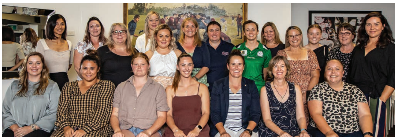
The 2021 Women in Rugby Leadership Conference group

2022 will see an increased focus on Platform (more coaches, match officials, administrators and executive members), Equity (adoption of state and affiliate Gender Equity and Inclusion Statements) and Accountability (mandatory governance and inclusion training for committee members).