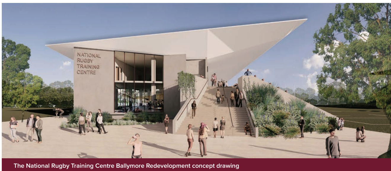
The National Rugby Training Centre Ballymore Redevelopment concept drawing

strategy of investment to set up the game for long-term success through a Future Fund.