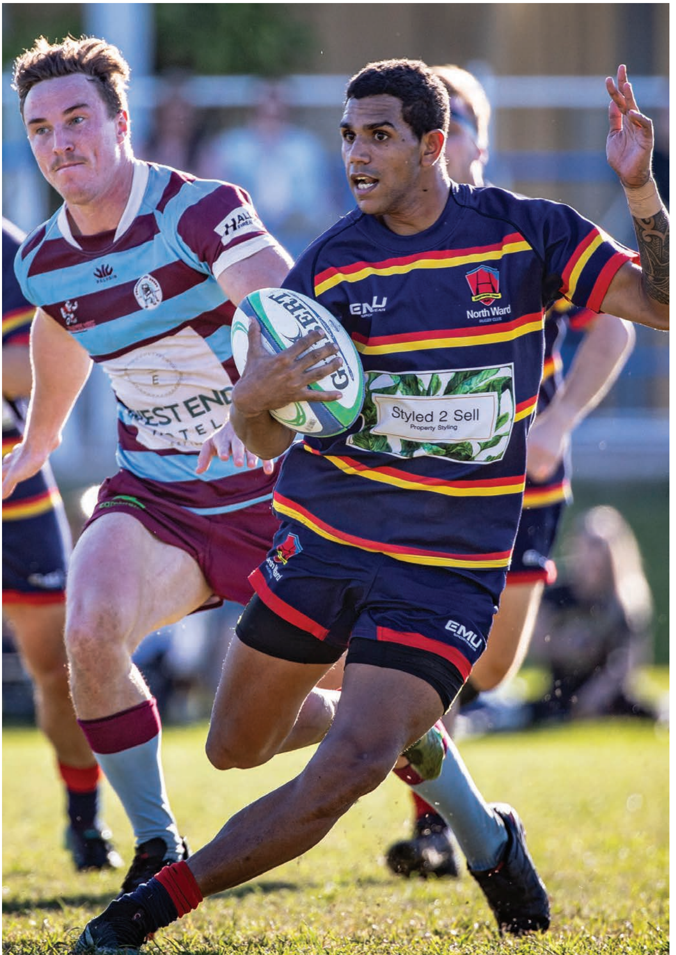
North Ward Old Boys in action at Hugh Street in Townsville.