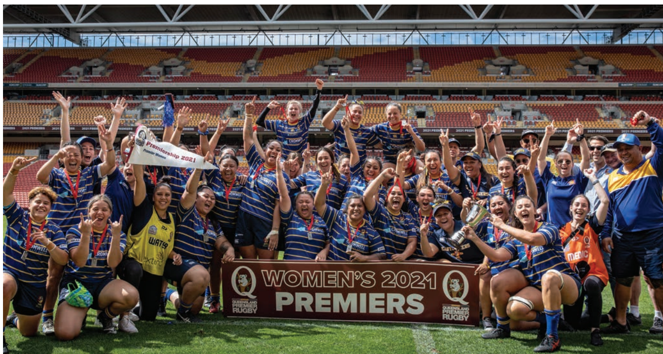
Easts Women secured back-to-back Premierships in 2021