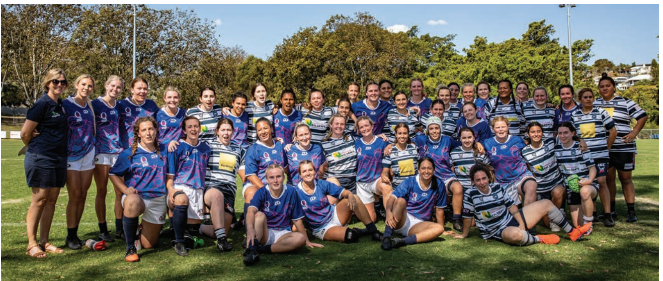
Queensland Country Orchids and Brothers women.