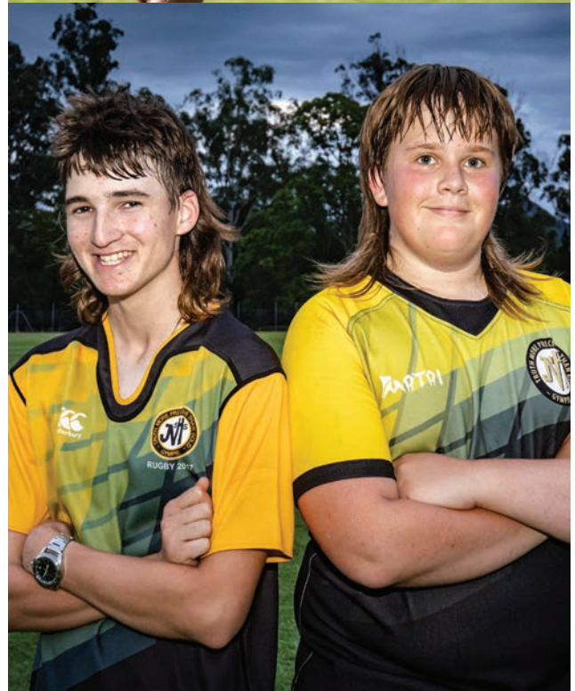
TOP: Moreton Bay Cup action at Caboolture Snakes RC