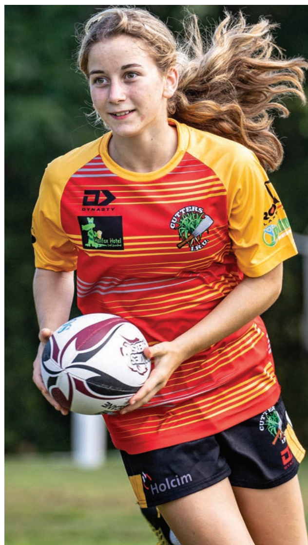
Ingham junior runs with the ball