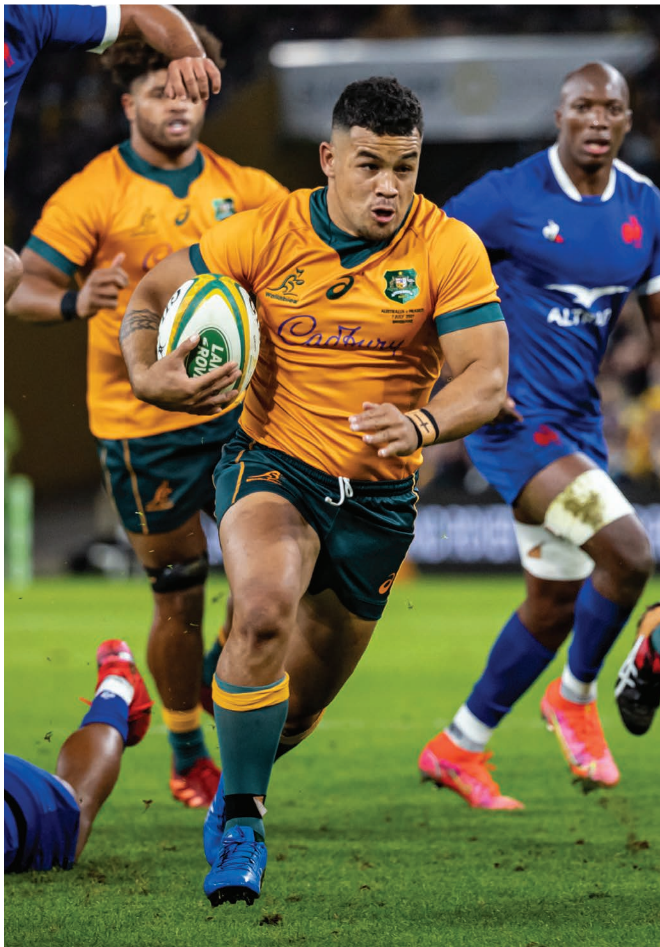
Hunter Paisami in action for the Wallabies against France at Suncorp Stadium.