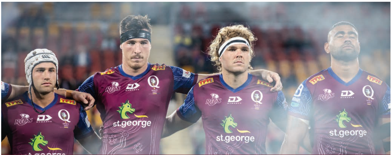
Reds players take part in a smoking ceremony before their Indigenous Round clash.