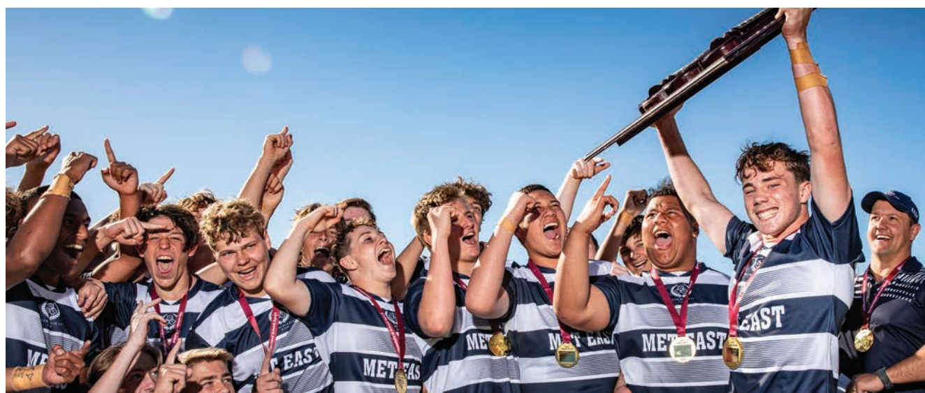
Met East celebrate their win at the U15 QRFSU State Championships

President – Western Queensland Rugby Union