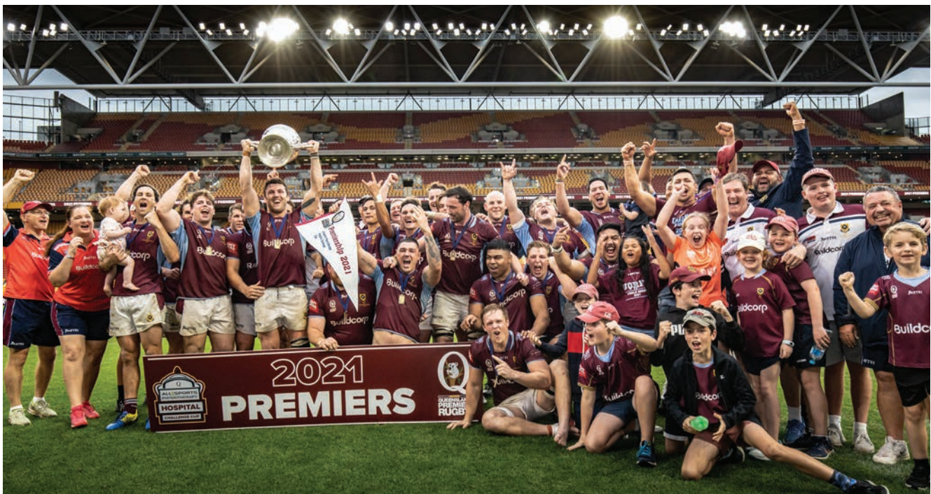
University of Queensland celebrate their Grand Final victory.