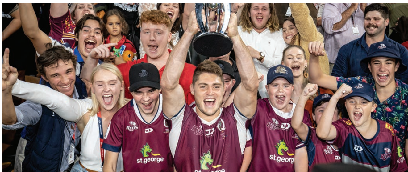
James O'Connor celebrates the Reds' Grand Final win with fans