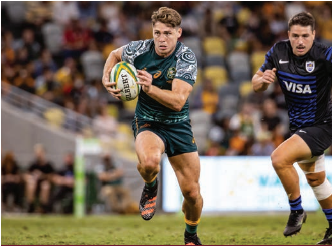
James O'Connor in action for the Wallabies in Townsville.