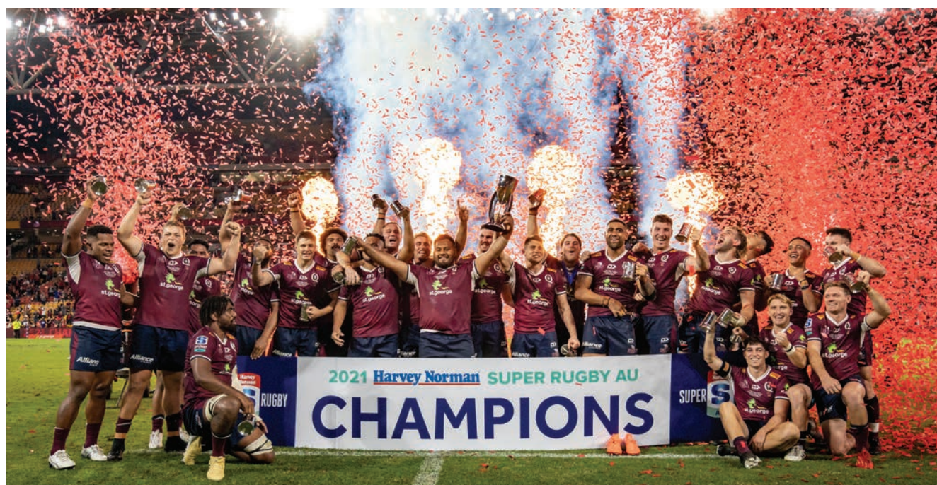
Queensland Reds celebrate their Super Rugby AU title.