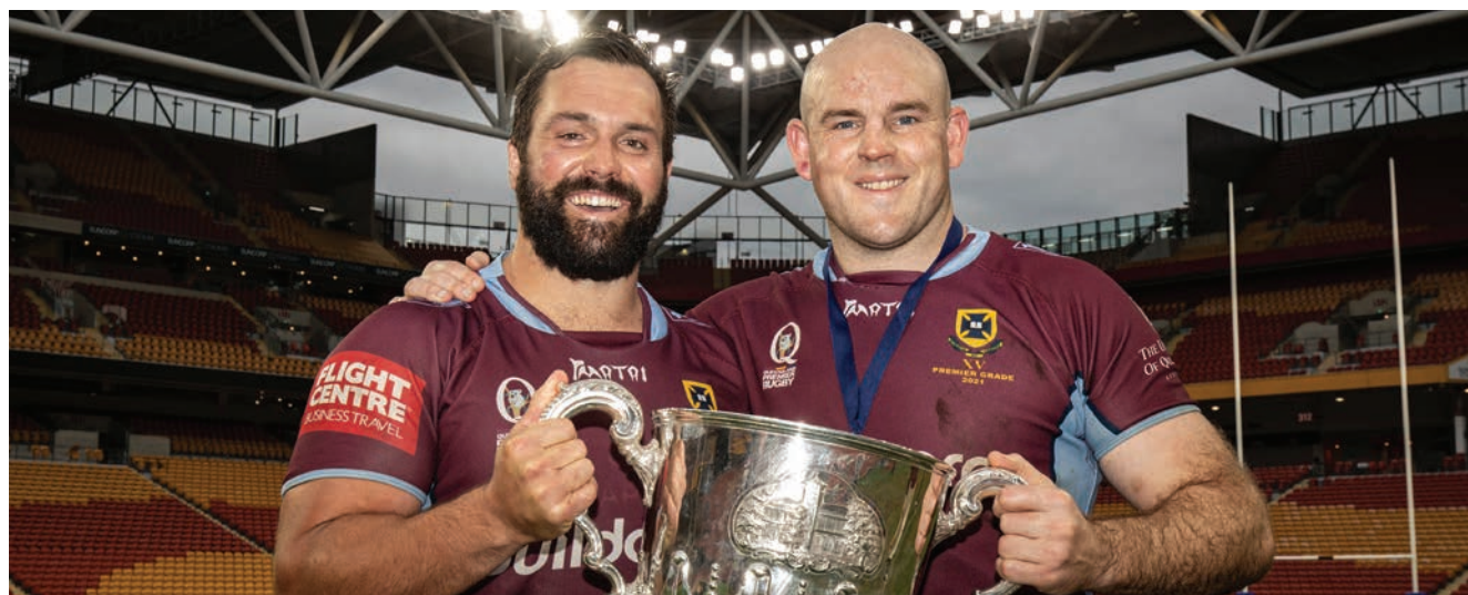
University of Queensland stalwart hookers James Hanson and Stephen Moore return to help Red Heavies claim Hospital Cup.