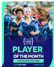
Player of the Month