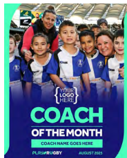
Coach of the Month