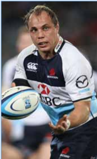
The year saw Phil Waugh become the most capped player, captain and flanker in NSW history.