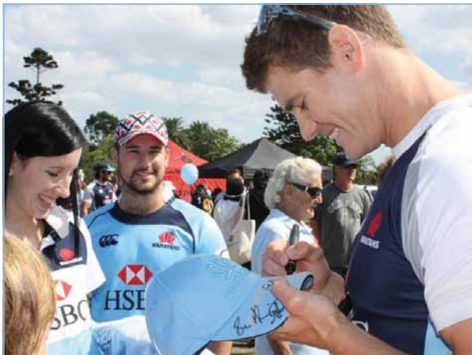
Berrick Barnes meets supporters at a Fan Day.