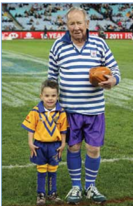
NSW's oldest and youngest players come together for Rugby Reunion against the Brumbies.