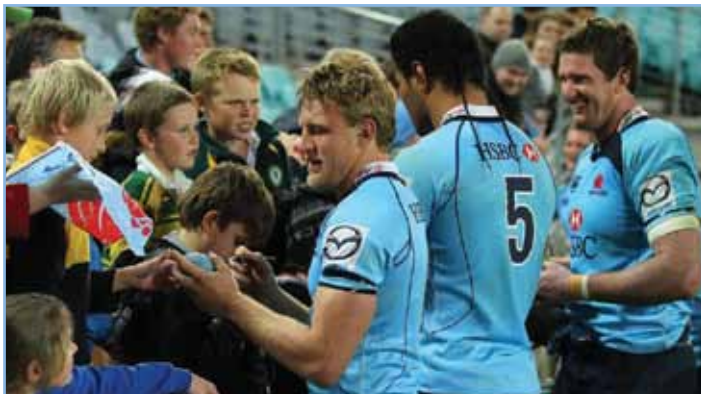
Finals time: Players and fans celebrate with qualification in the bag.

Four second half tries helped the home side to a convincing victory, equalling the biggest winning margin over the Brumbies in Super Rugby and ensuring qualification for the 2011 Super Rugby finals. The result means the HSBC Waratahs recorded a 7-1 win-loss record within the Australian conference, scoring 27 tries and conceding just three.