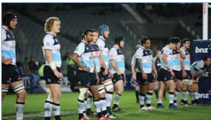
A dream shattered: The HSBC Waratahs line up for a Blues conversion.

Saturday June 25, Eden Park, Auckland, NZ.