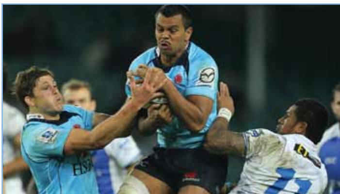
On the money: Kurtley Beale turned in a stand out performance.

Saturday May 7, Sydney Football Stadium, Sydney.