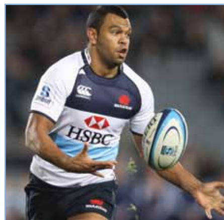
2011 Players' Player of the Year, Kurtley Beale