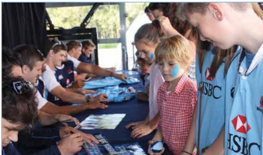
Young fans make the most of a signing opportunity.

Income from Corporate Hospitality was another area of growth, with revenue up 36% versus 2010. In 2012 Waratahs Rugby will be re-evaluating its product portfolio with a view to create a paradigm shift that will