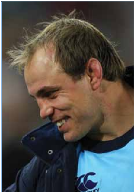
End of an era: Captain Phil Waugh bows out after winning the round 18 Super Rugby match against the Brumbies

toll proved too much in the semi-final. Despite going two-tries-all in Auckland, the Blues were too good and for the second year running the sky blues bowed out in the first week of the finals. That the team made it that close is a credit to those left standing, when the injured list for the match included Sekope Kepu, Tatafu Polota-Nau, Damien Fitzpatrick, Al Baxter, Dan Vickerman, Wycliff Palu, Ben Mowen, Pat McCutcheon, Luke Burgess, Berrick Barnes, Drew Mitchell, Rob